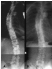
Figure 4. AP standing radiographs in (A) 1990 and (B) 2005.

From 1990 (Figure 4A) through 2005 (Figure 4B) the magnitude of Cobb angle for the primary thoracic curve declined by >10 degrees (Table 2). Grade I-II rotation of each apical vertebra was present [64].